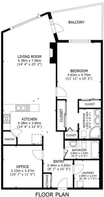
#203-9708 110 ST RIVERVIEW GREEN WIKWENTOWIN, EDMONTON

GROSS INTERNAL AREA FLOOR PLAN: 105.00 m 2 (1,115 sq. ft.) TOTAL: 105.00 m 2 (1,115 sq. ft.) SIZES AND DIMENSIONS ARE APPROXIMATE, ACTUAL MAY VARY