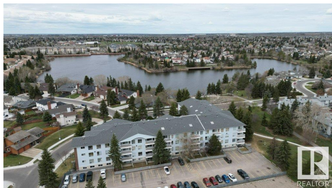
101-15503 106 St, Edmonton, AB